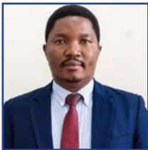
Hon. Dr. Selemani JAFO Minister of Industry and Trade