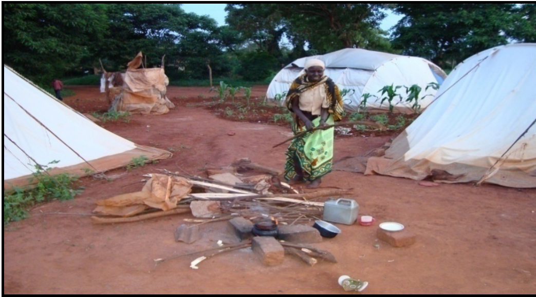
Photo 2: A woman from displaced families due to GGM expansion in Geita

generated by mining activities and lack of community participation on proposed development projects.